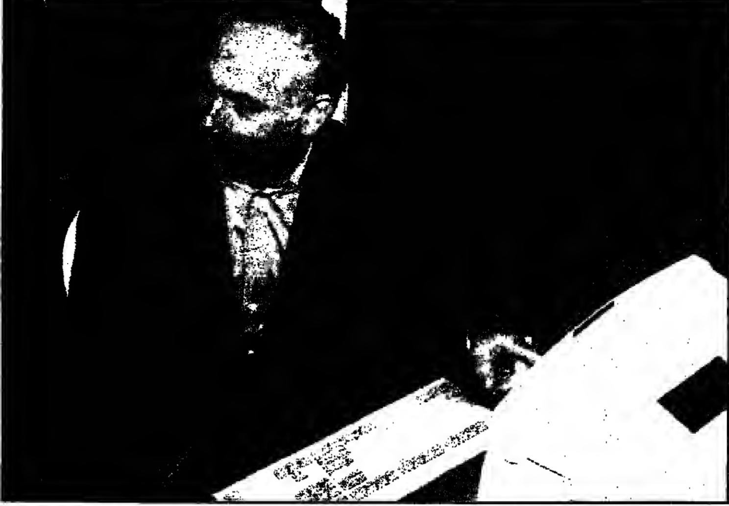
Likud Chairman Binyamin Netanyahu shows how he cast his ballot in yesterday's party primaries in Jerusalem.